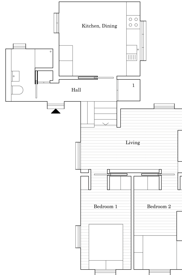
Illustration for identification purposes only. All measurements are approximate and rounded values.